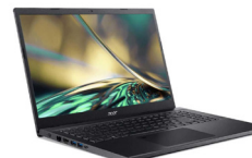
Aspire A315-59-71R0 _Pure Silver ACR-NXK6TST006