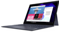
(หน้าจอรองรับการใช้น้ำหนัก และมีแถบมาให้อีกสอง) Yoga Duet7 13ITL6 (LTE) LNV-82Q7000LTA