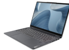
(หน้าจอรองรับการใช้น้ำหนัก และมีแถบมาให้อีกสอง) Ideapad Flex 5 14IAU7 LNV-82R7003DTA