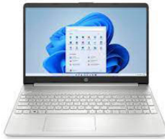
HP 15s-eq3002AU ( Natural silver ) HPI-6X9J4PA#AKL