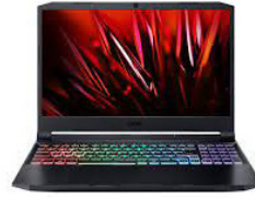
Nitro AN515-57-99W3_Shale Black ACR-NHQFEST006