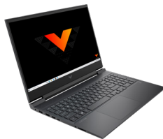
HP VICTUS 15-fb0008AX ( Mica silver ) HPI-6F7V3PA#AKL