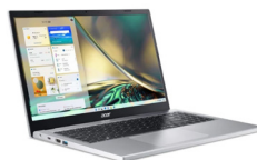
Aspire A315-24P-R817 _Pure Silver ACR-NXKDEST00M