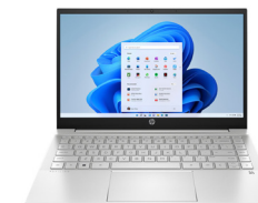
HP Pavilion 14-eh0036TU ( Natural silver aluminum ) HPI-767W6PA#AKL