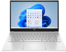
HP Pavilion 14-eh0031TU ( Natural silver aluminum ) HPI-6R4A7PA#AKL