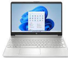
HP 15s-eq2203AU ( Natural silver ) HPI-78J24PA#AKL