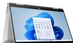
HP Pavilion x360 14-ek0000TU ( Natural silver ) Touch HPI-6Q419PA#AKL