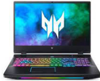
Predator PH517-52-7290_Abyssal Black ACR-NHQCPST006