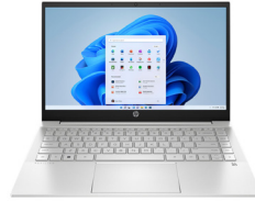
HP Pavilion 14-eh0030TX ( Natural silver aluminum ) HPI-6R3R4PA#AKL