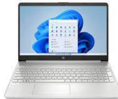
HP 15s-fq5154TU (Natural silver) HPI-78J27PA#AKL