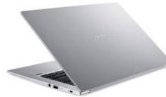
Swift SF314-511-57PD_Pure Silver ACR-NXABNST006