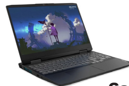
New Gaming 3 15IAH7 LNV-82S900RUTA