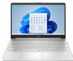
HP 15s-eq3064AU ( Natural silver ) HPI-78J25PA#AKL