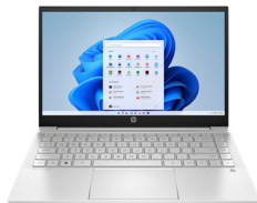
HP Pavilion 14-eh0029TX ( Natural silver aluminum ) HPI-6R4A6PA#AKL