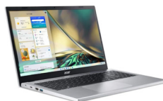
Aspire A315-59-33NG _Pure Silver ACR-NXK6TST008