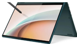
(หน้าจอรองรับการใช้น้ำหนัก และมีแถบมาให้อีกสอง) Yoga 6 13ALC7 LNV-82UD004GTA