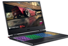
Nitro AN515-46-R12A Obsidian Black ACR-NHQH3ST004