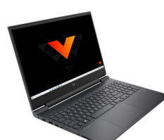
HP VICTUS 15-fb0007AX ( Mica silver ) HPI-6F7N6PA#AKL