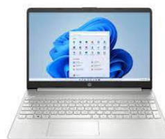
HP 15s-eq3065AU ( Natural silver ) HPI-78J26PA#AKL