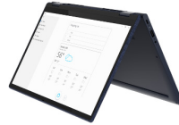
(หน้าจอรองรับการใช้น้ำหนัก และมีแถบมาให้อีกสอง) Yoga 6 13ALC6 LNV-82ND000DGTa