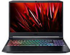
Nitro AN515-57-9710_Shale Black ACR-NHQEUST009