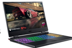
Nitro AN515-58-55UB Obsidian Black ACR-NHQFHST005