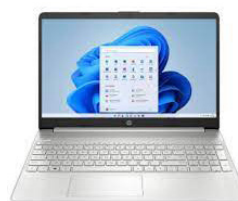
HP 15s-fq5156TU ( Natural silver ) HPI-787S7PA#AKL